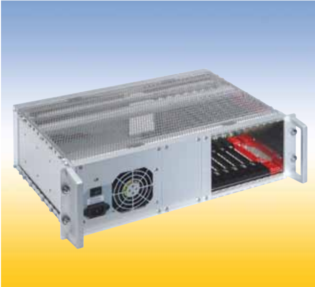
System-Module CompactPCI-3 U-Rear I/O