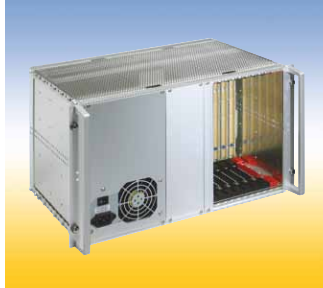
System-Module CompactPCI-6 U-Rear I/O