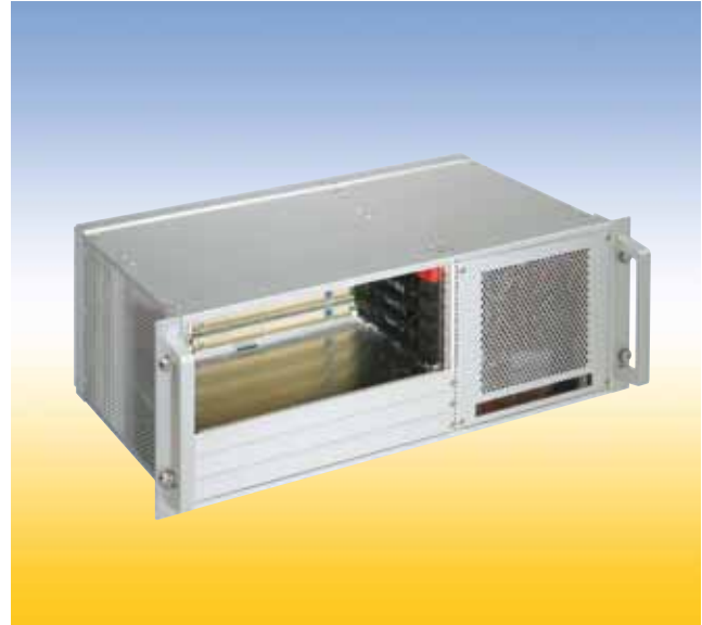
System-Module CompactPCI-4 U-Rear I/O