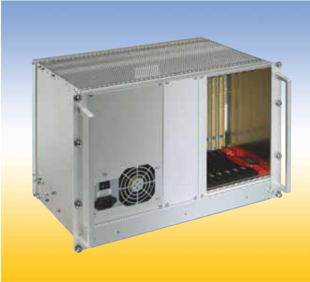
System-Module CompactPCI-6+1U-Rear I/O